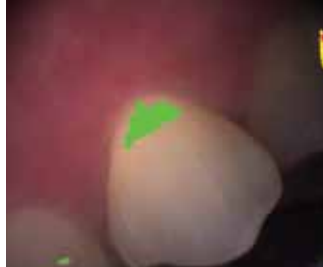
The CS 1600 identifies suspicious areas during screening. Use FIRE to conduct further analysis.