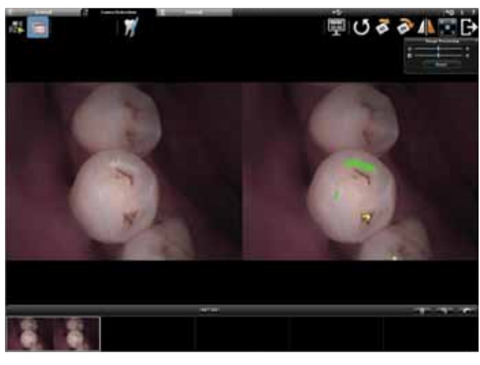
The CS 1600 acquisition interface includes the following modes: