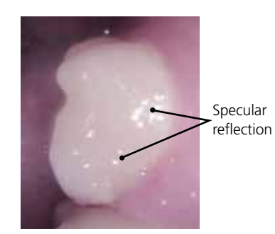
Presence of specular reflection masks carious features.

The CS 1600's unique scanning feature promotes faster examinations while FIRE technology identifies areas of concern. Unlike other devices that force the user to take multiple readings on each tooth and record the results by hand, the CS 1600 provides a streamlined workflow—eliminating cumbersome "pin-point" exam protocols. The camera intuitively gathers information from the image and quickly displays it on the monitor, allowing users to focus on a specific region of interest. This allows you to quickly capture the data you need without removing the camera from the patient's mouth after each reading.