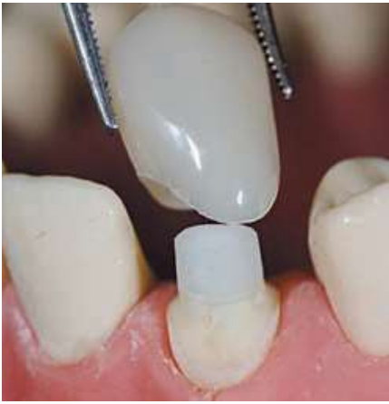
10. temporary crown