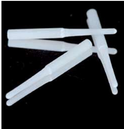
14. UNIC® post