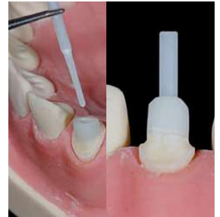
15. try UNIC® post for fit