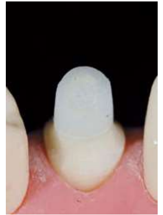
19. trim post, finished work