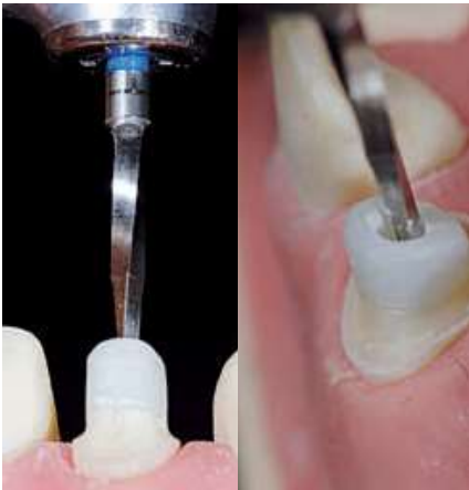
13. use UNIC® reamer through UNIC® core hole to open canal and calibrate