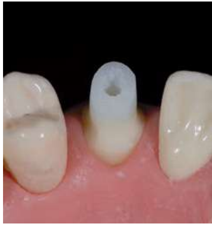
11. temporary crown