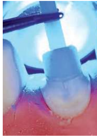
18. insert UNIC® post and light cure