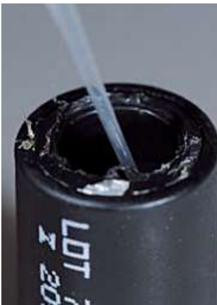
16. use SHOTBOND® to optimize bonding