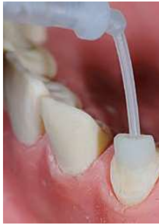
17. CORPOSIT® in canal through UNIC® core hole