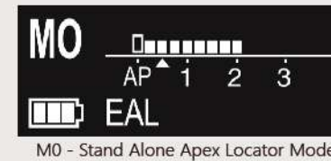
M0 - Stand Alone Apex Locator Mode

Powerful Battery Heavy duty 1500mAh Lithium battery