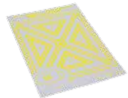
REF. EC.STEAM 98.2