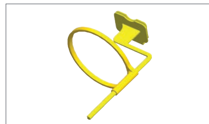
Kwik-Bite with Ring