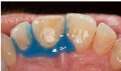
Palatal view with applied gingiva protector LC Dam