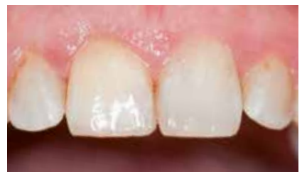
Aesthetically convincing result