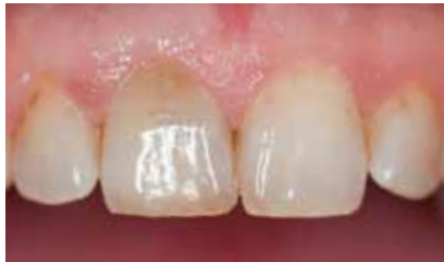
Clearly visible discoloration in tooth 11