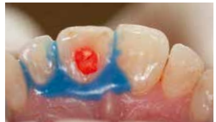
Perfect Bleach Office+ in the pulp chamber