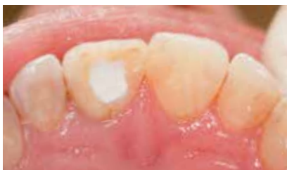
Tight obturation of the cavity with a glass ionomer material