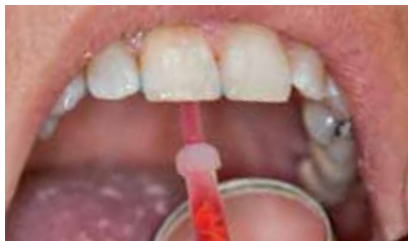
Insertion of the whitening gel into the cavity with the enclosed fine cannula