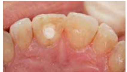
Open pulp cavity with obturation of the canal opening