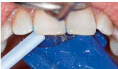
Careful rinsing and aspiration of the whitening gel