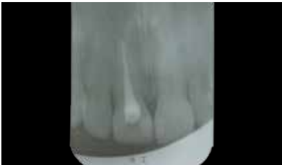
Marginal, clinically perfect root filling in tooth 11