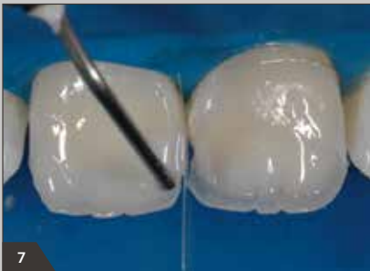
7 Forming the incisal edges with the highly translucent Amaris Flow HT