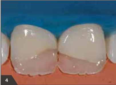
4 Application of Amaris TL to reconstruct the palatal enamel portion