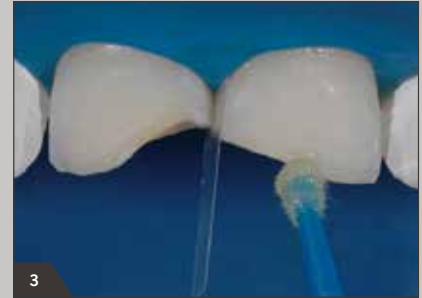
3 Application of the adhesive