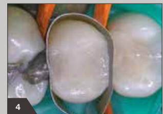
4 Final layer with translucent enamel shade