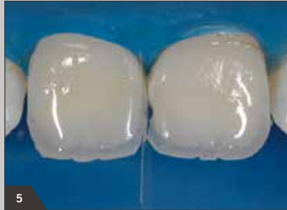
5 Modelling the dentine and mamelons with Amaris O1