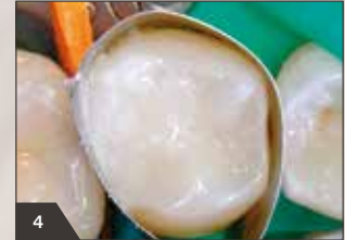
4 Final layer with translucent enamel shade