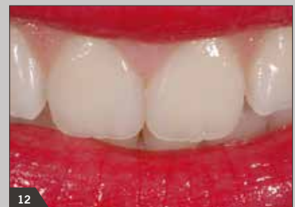
12 Anterior restorations indistinguishable from the natural teeth