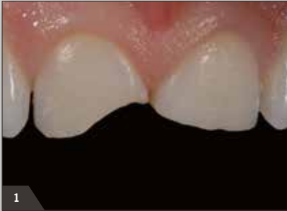
1 Initial situation: incisal fracture in teeth 11 and 21