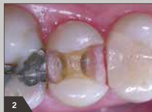
2 Situation after removal of the filling and complete excavation