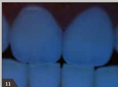
11 Fluorescence like with natural teeth