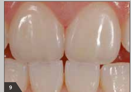
9 Completed anterior restoration