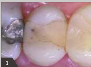
1 Insufficient mod composite restoration in tooth 25