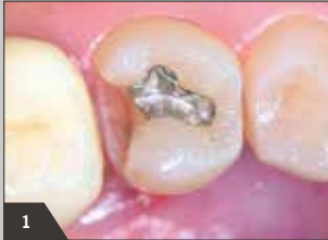
1 Fractured occlusal distal amalgam filling in tooth 45