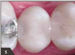
5 Finished, polished restoration