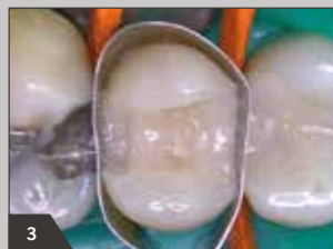
3 Incremental layers of opaque dentine base shade