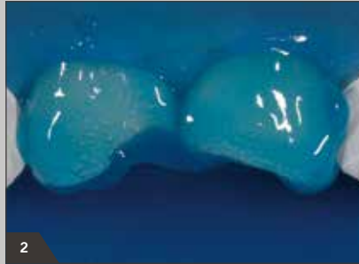
2 Conditioning the tooth substance with 37 % phosphoric acid