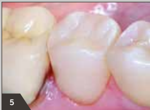
5 Finished, polished restoration (vestibular view)