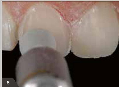
8 High gloss polish of the restoration