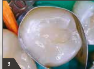
3 Opaque dentine base layer applied in increments