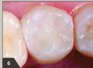
6 Finished restoration from occlusal view