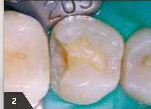
2 Placement of rubber dam and removal of remaining amalgam. Situation after complete excavation