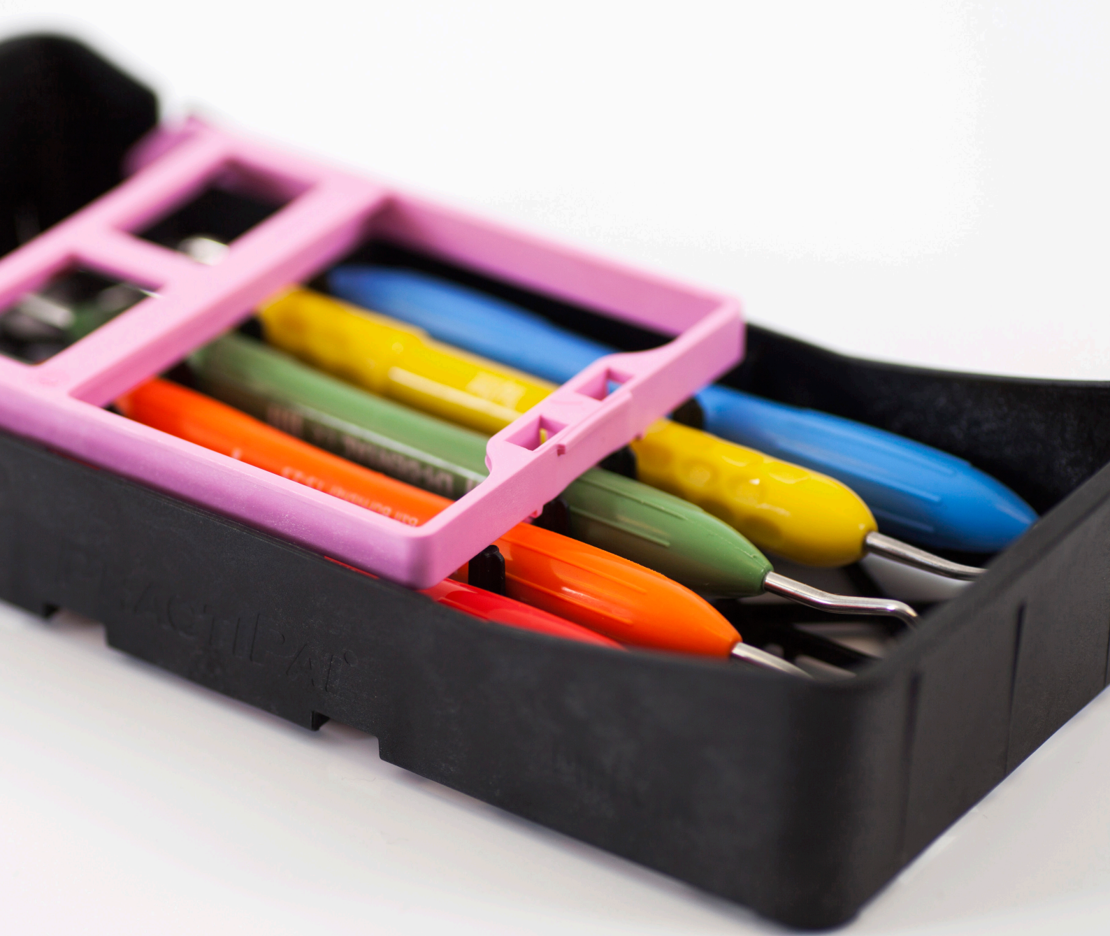
PractiPal® Mini Tray