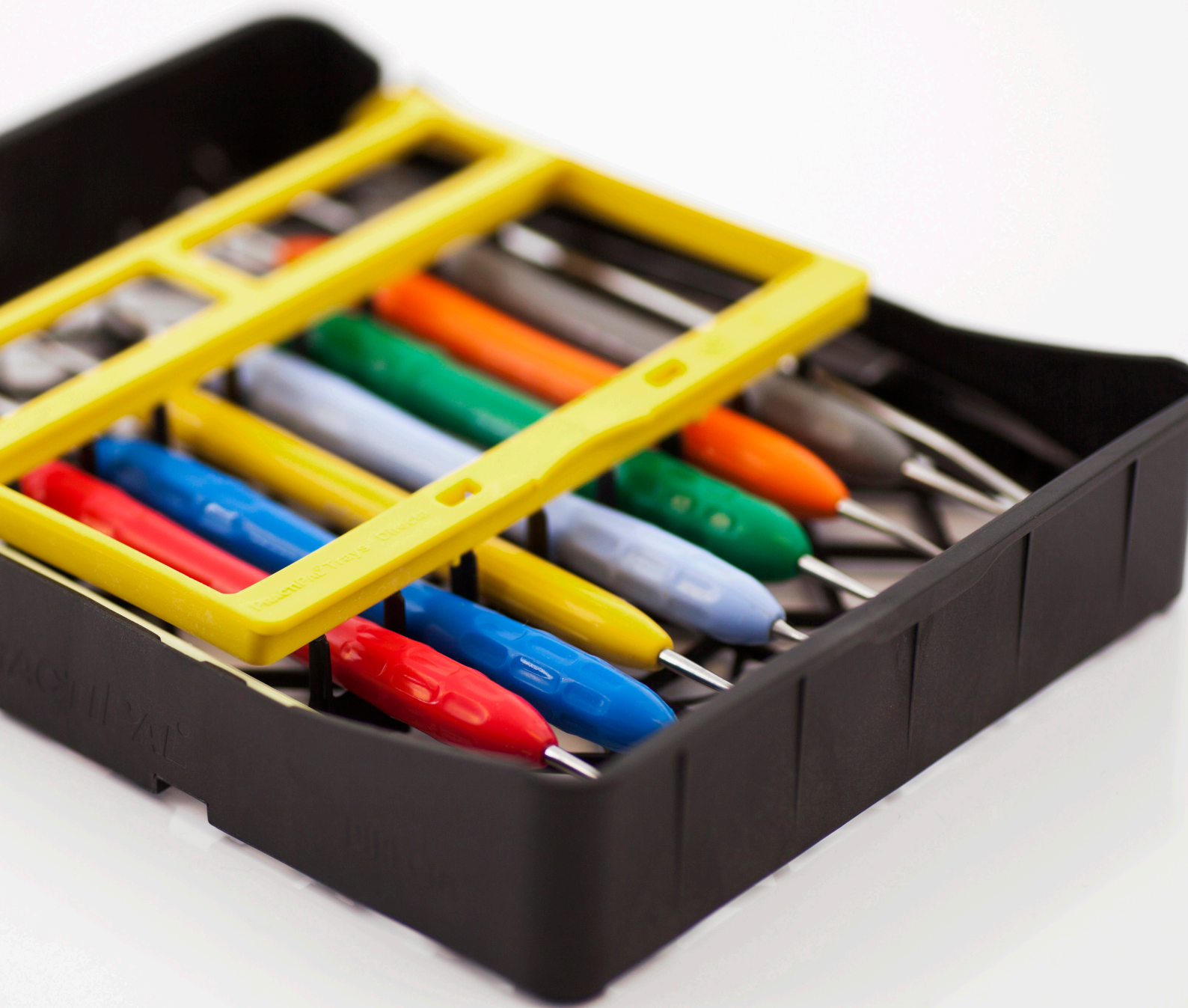
PractiPal® Half Tray