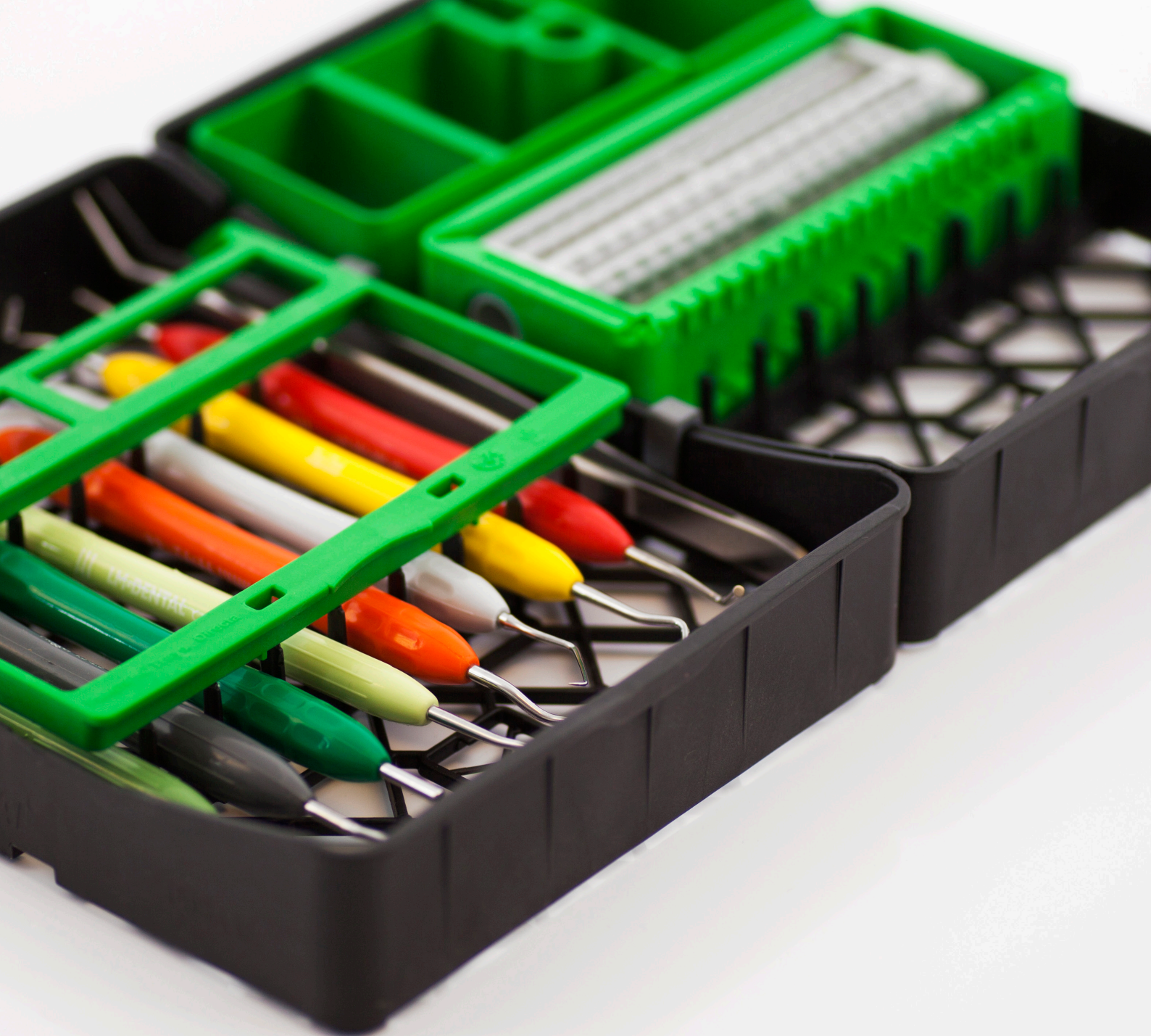
PractiPal® Full Tray