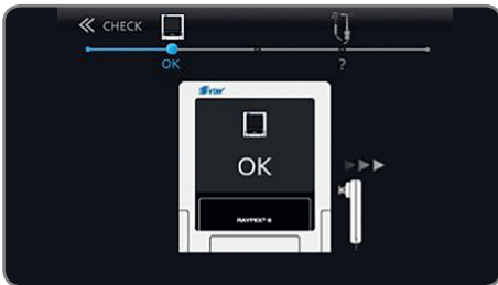
PLUG 'n CHECK: automated test of functions and cables